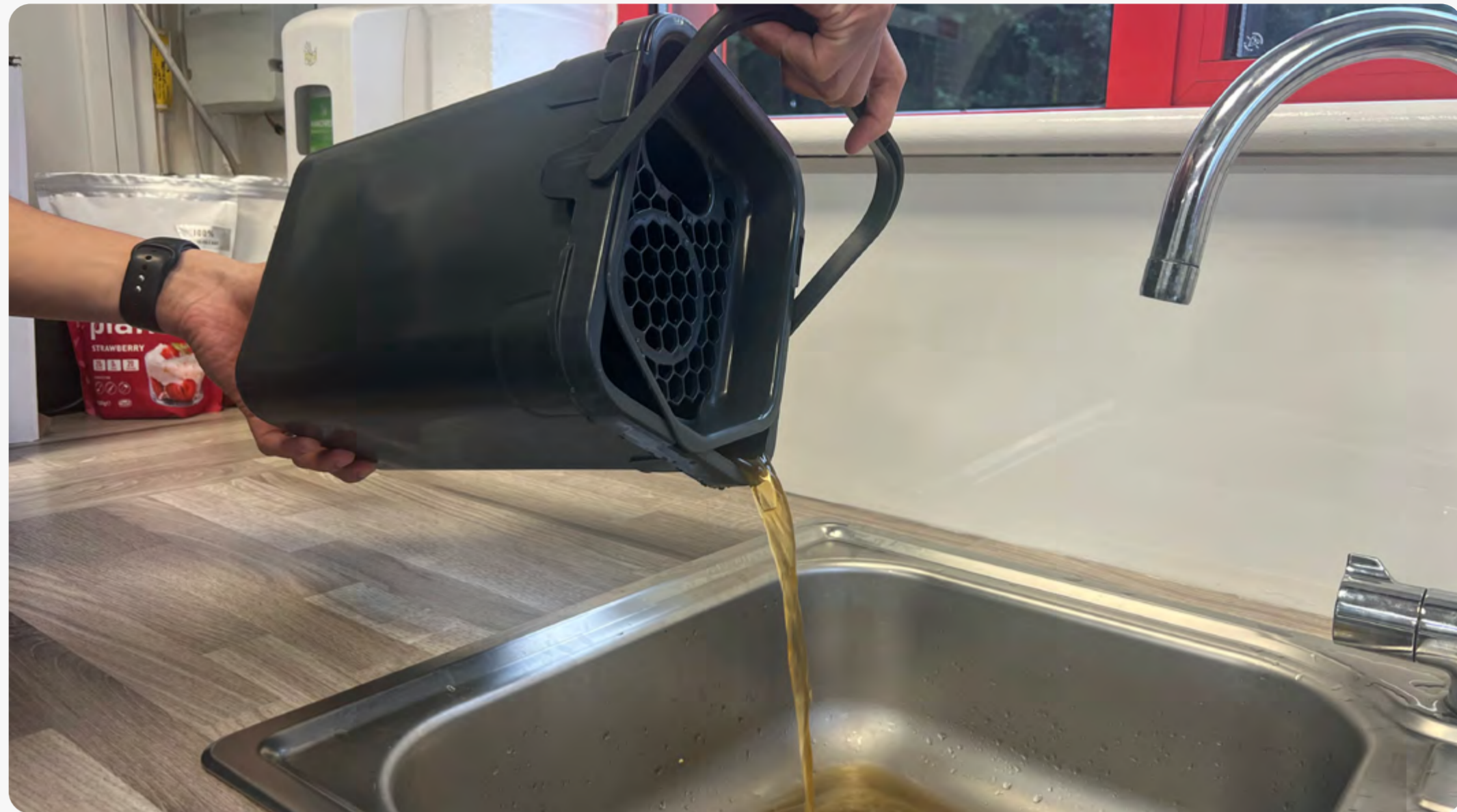
3 Pour the liquid from the bucket until its empty.