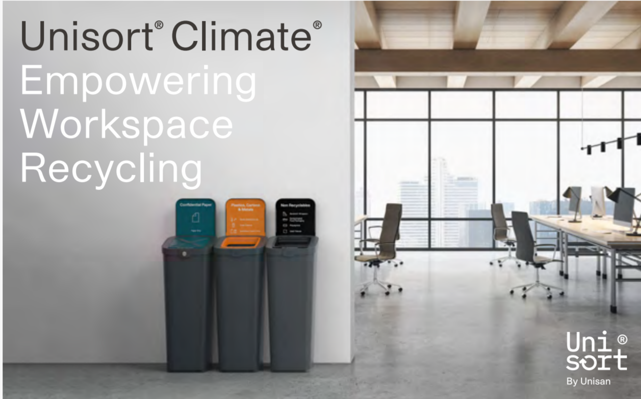
Unisort Climate An overview to the Unisort