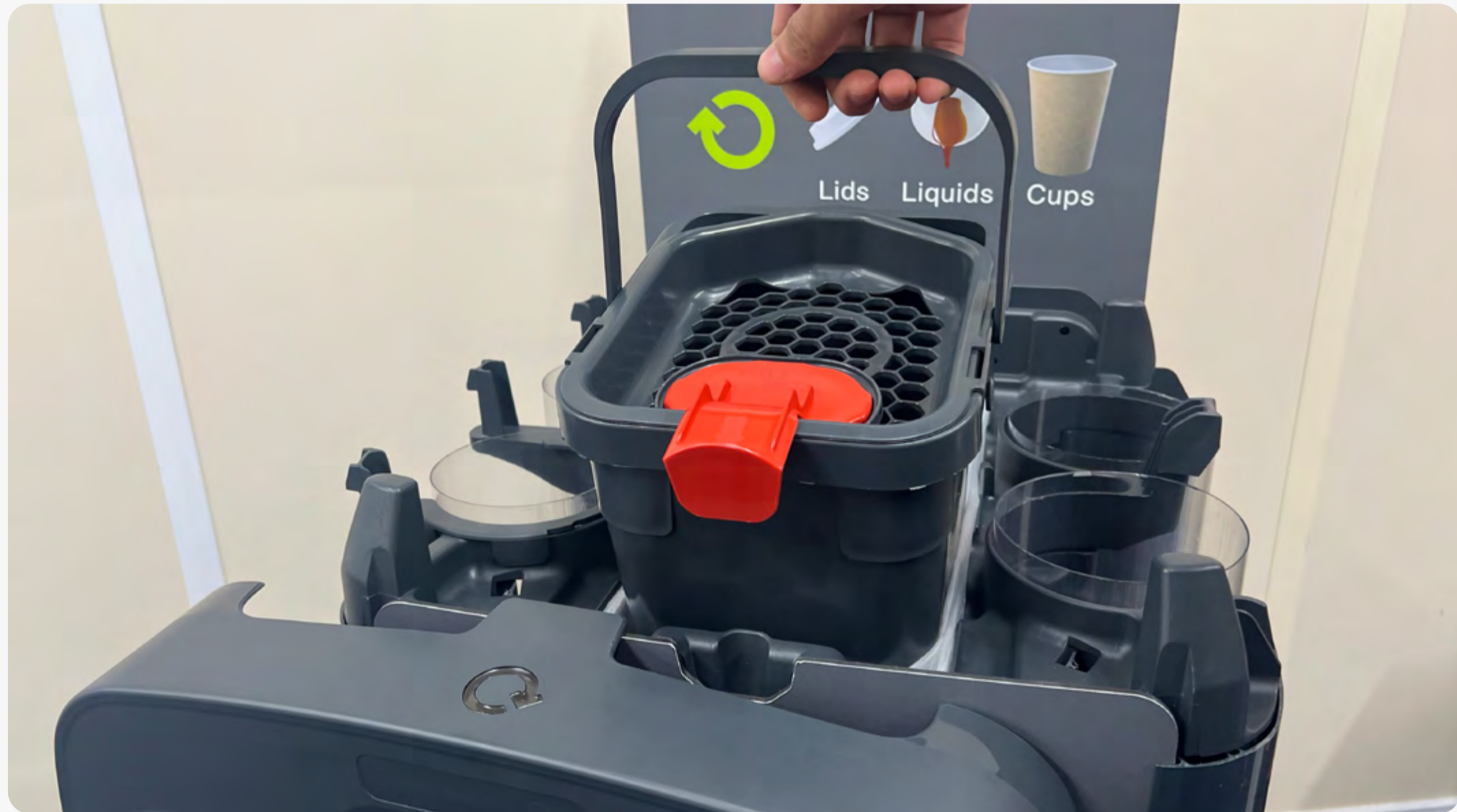
1 Hook the cover then lift the liquid bucket out of the unit and transport to the nearest sink.