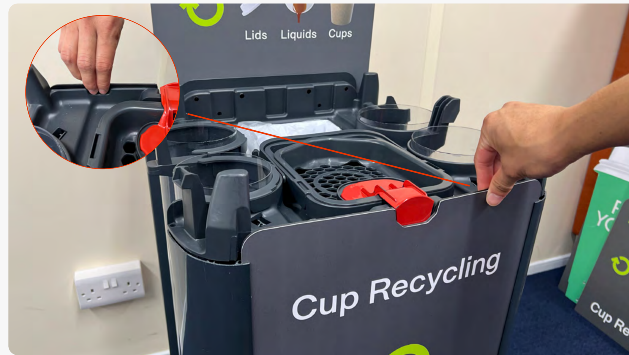
2 Lift out the existing graphic panel.