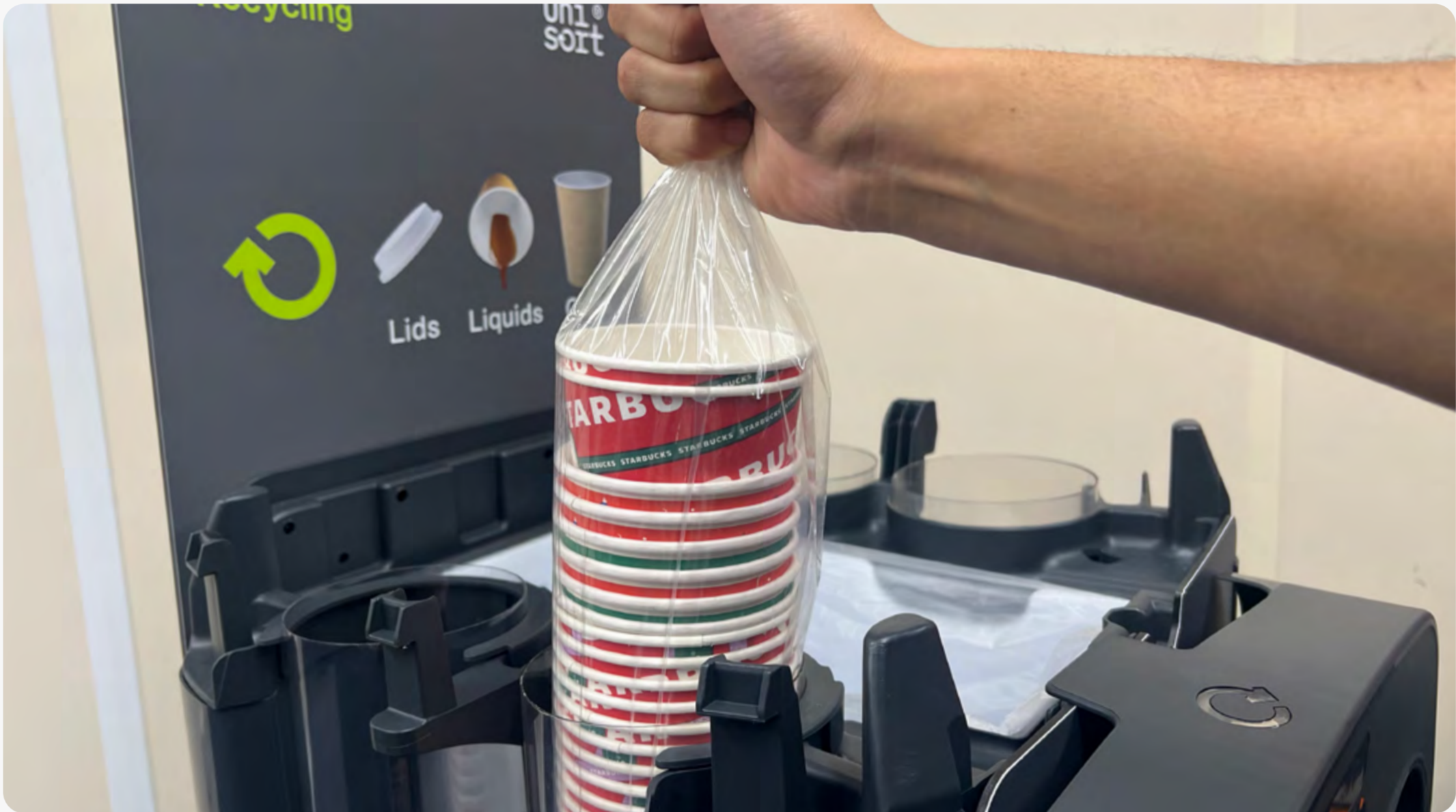
1 Remove the cover and hook it up on the front of the station, then remove bag of cups from the top.

Only applicable if using a bag with the tube