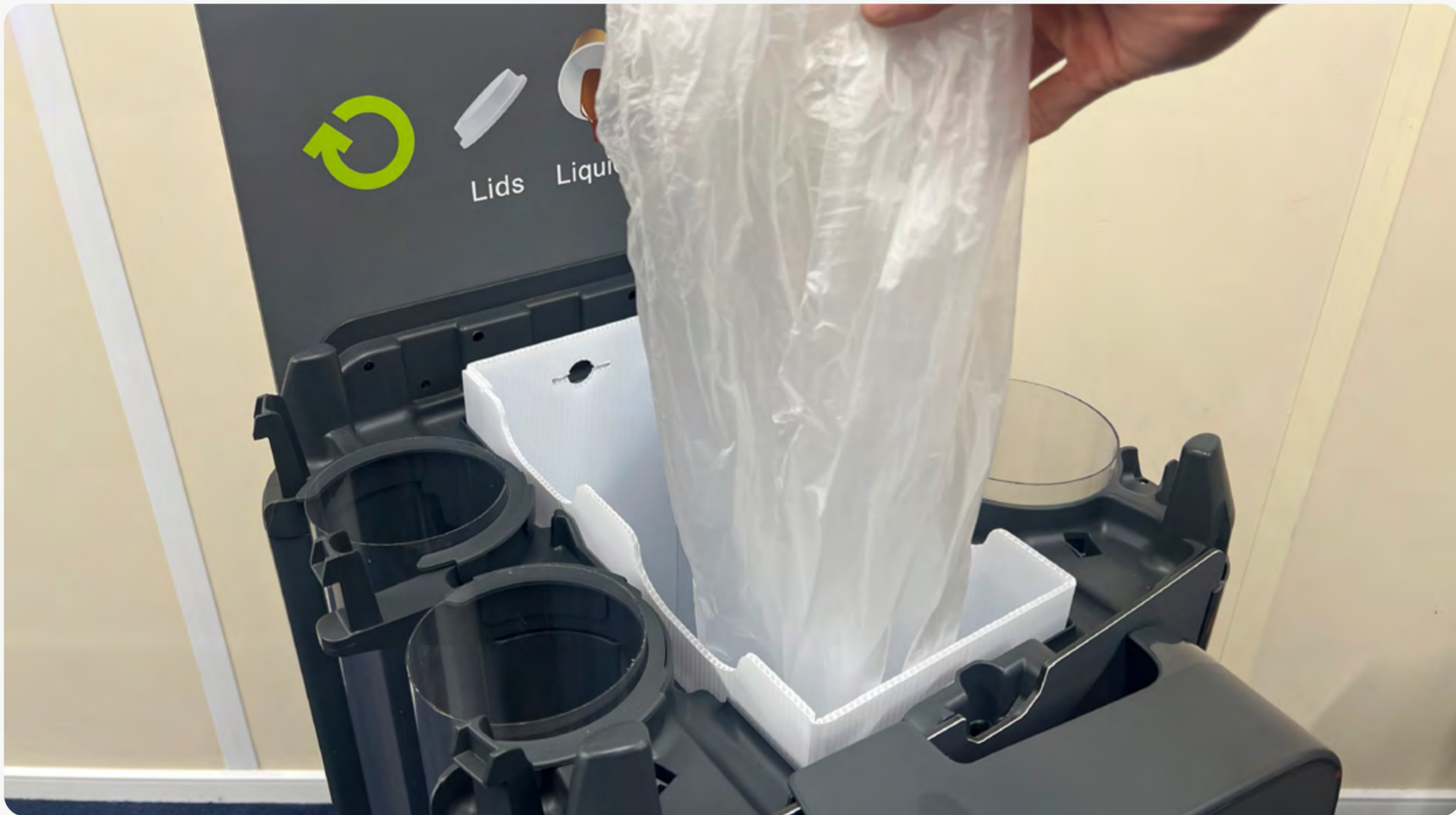
3 Line the central lid collector section with the large bags provided.