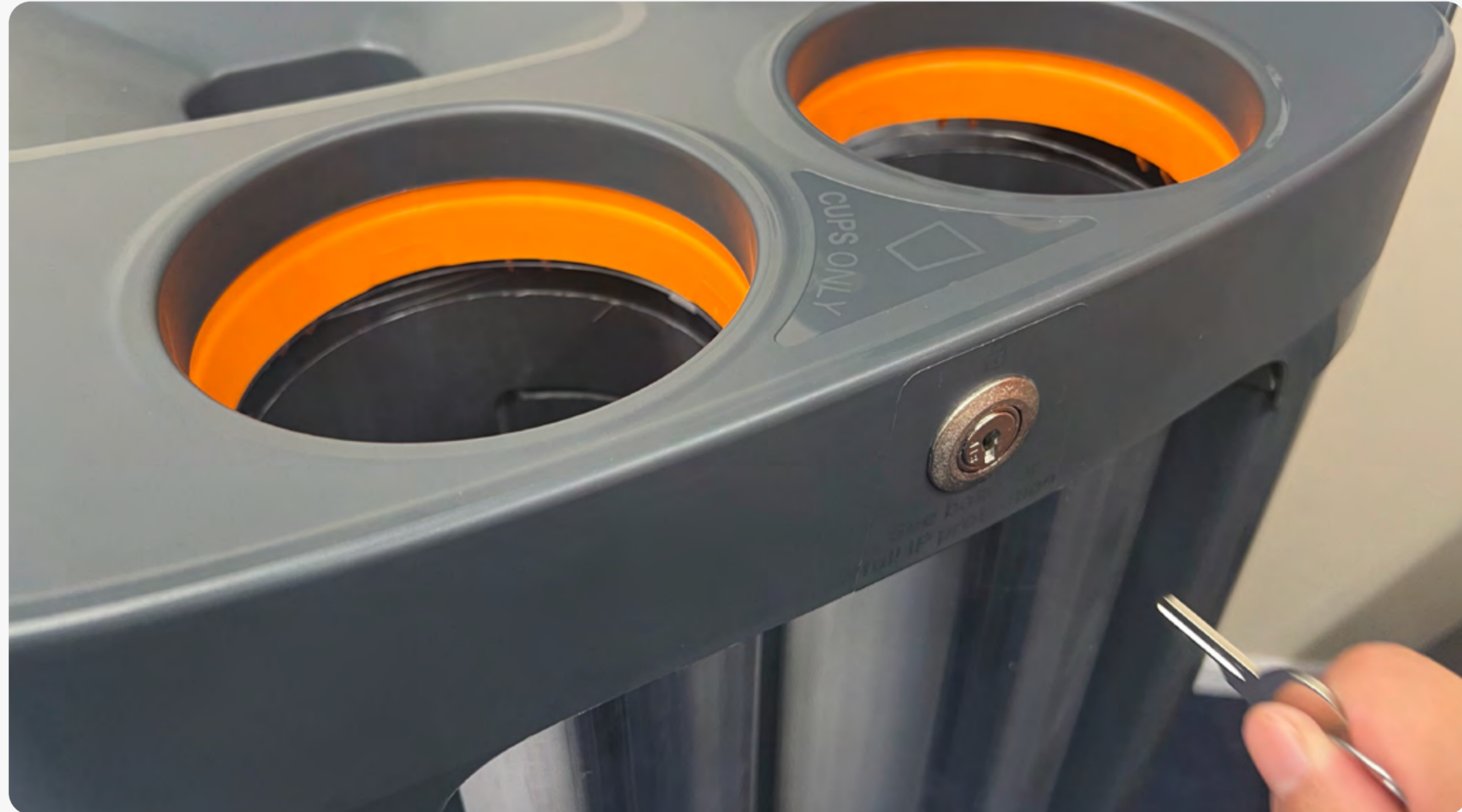
3 Your bin is now secured.