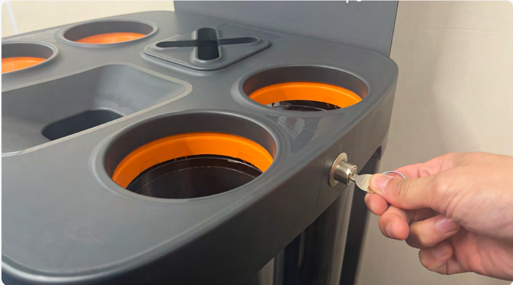
2 Lock the cover on the side using the key provided.