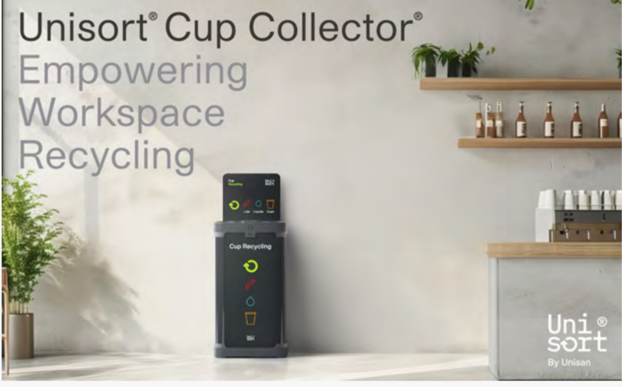
Unisort Cup Collector Our dedicated cup collecting