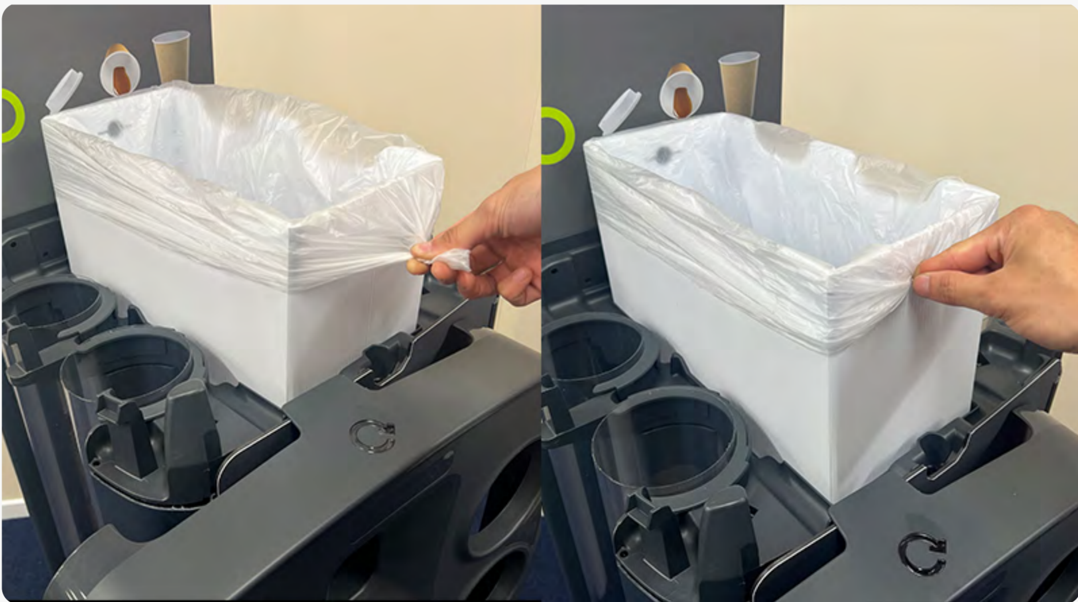
5 Twist and push bag through the hole in front of the central lid collector to secure then lower back into position.