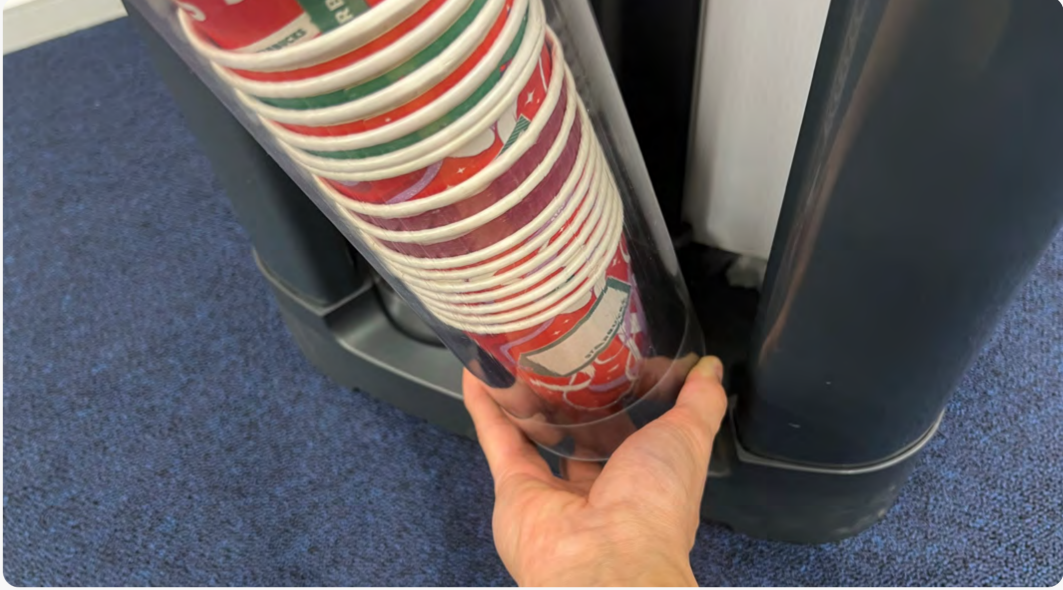
2 Support the bottom of the tube before lifting it out of the unit.