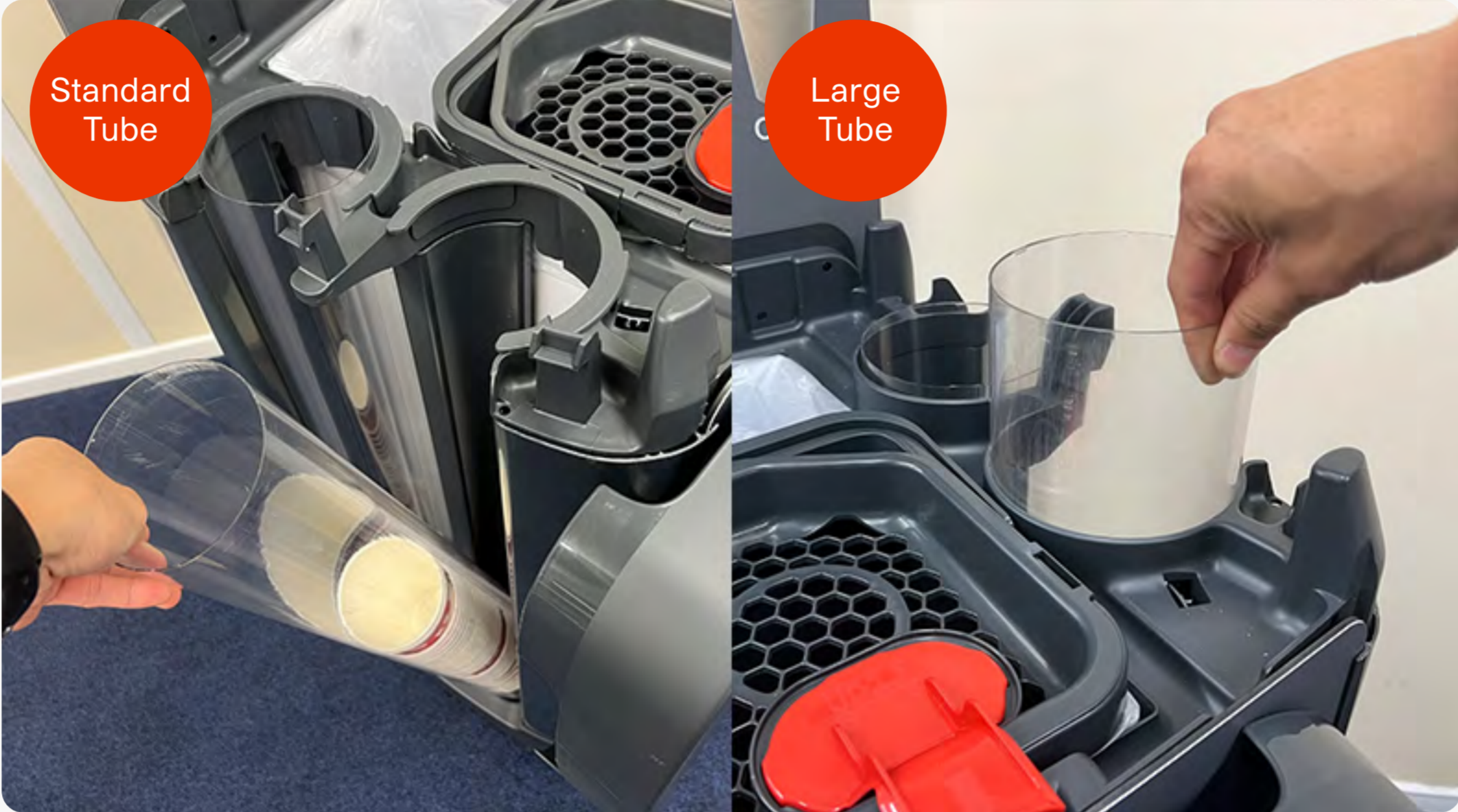
1 Standard Tube: Pull out tubes from the side or from the top. Large Tube: Pull out tubes from the top.

Only applicable if not using a bag with the tube