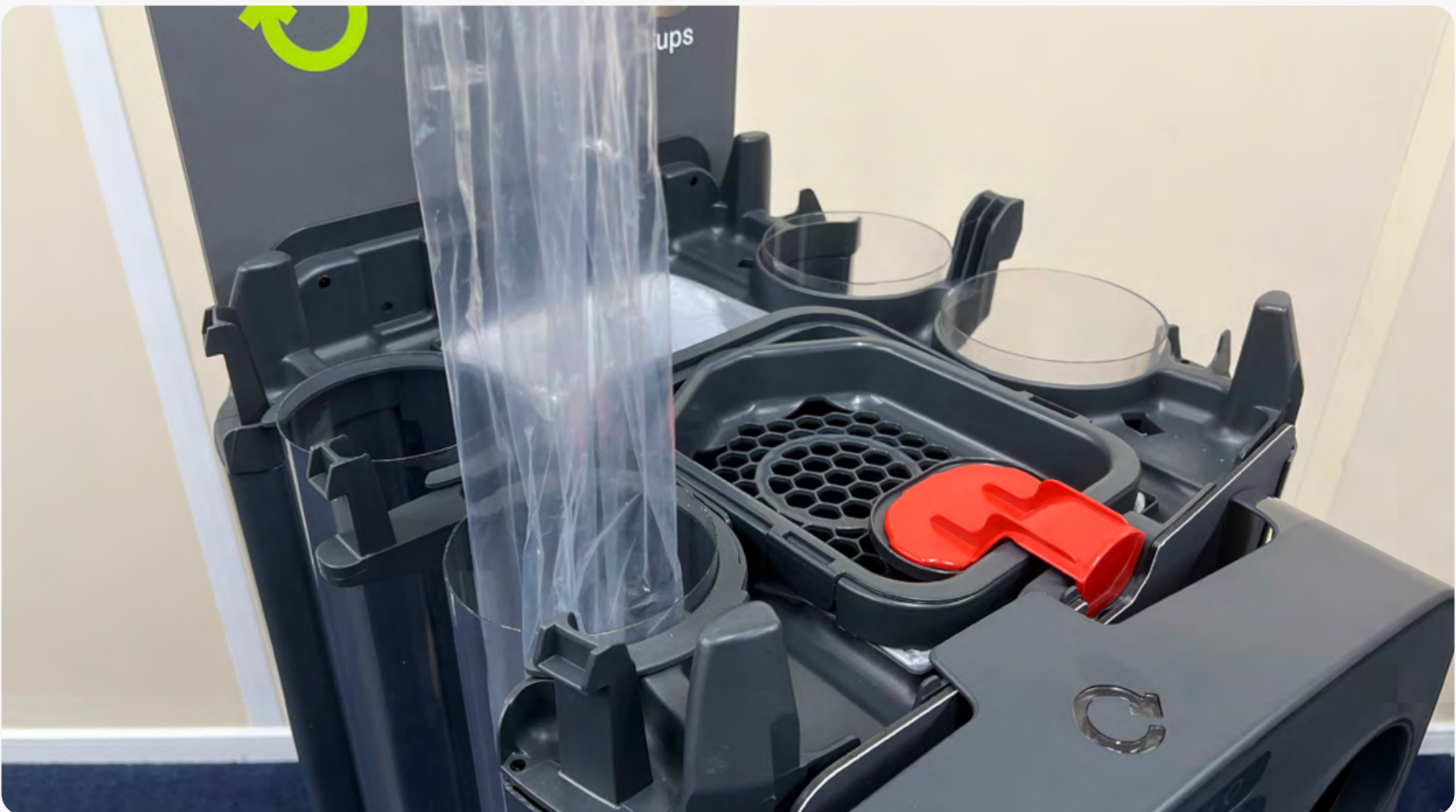
2 Slide small bag into the cup tube.