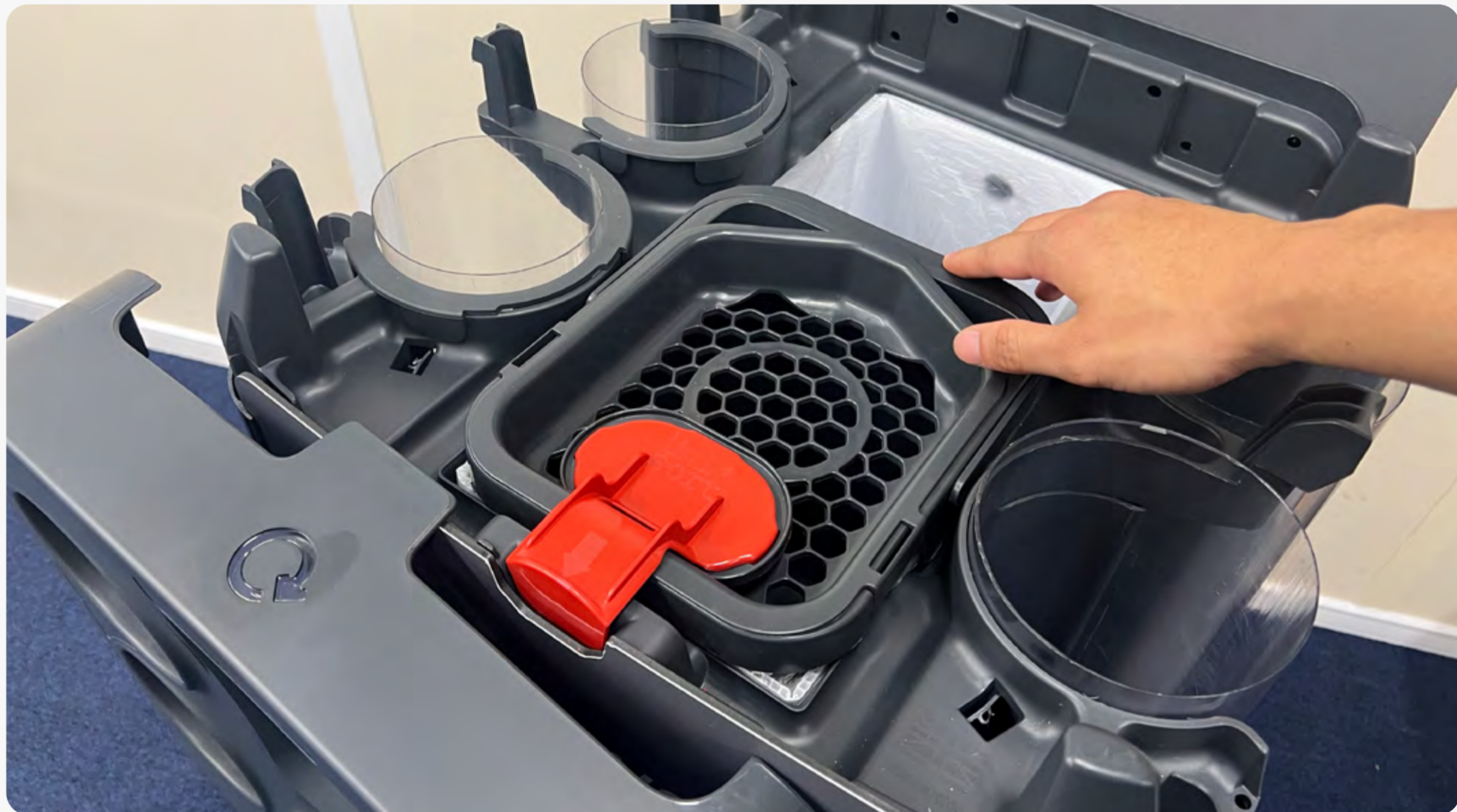
6 Return the liquid bucket back in the station, put the cover back on then it's ready to go.