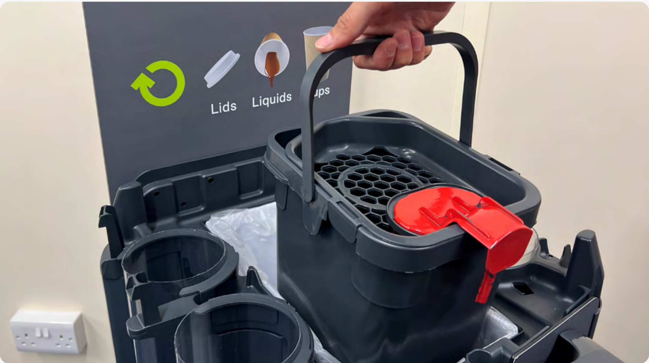
2 Remove liquid bucket and place on a flat surface then remove bag of cup lids.