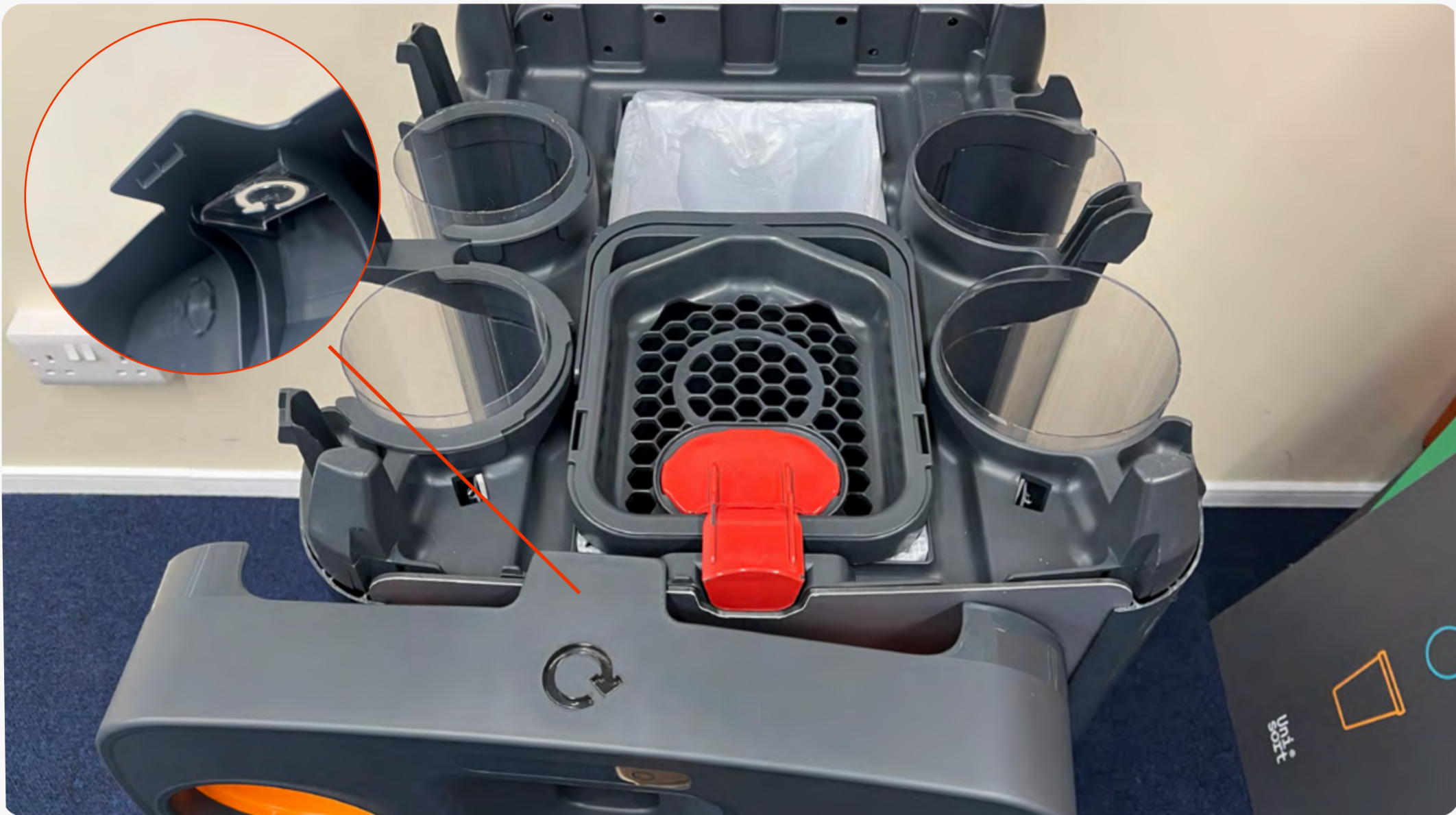
1 Remove the cover and hook it up on the front of the station.