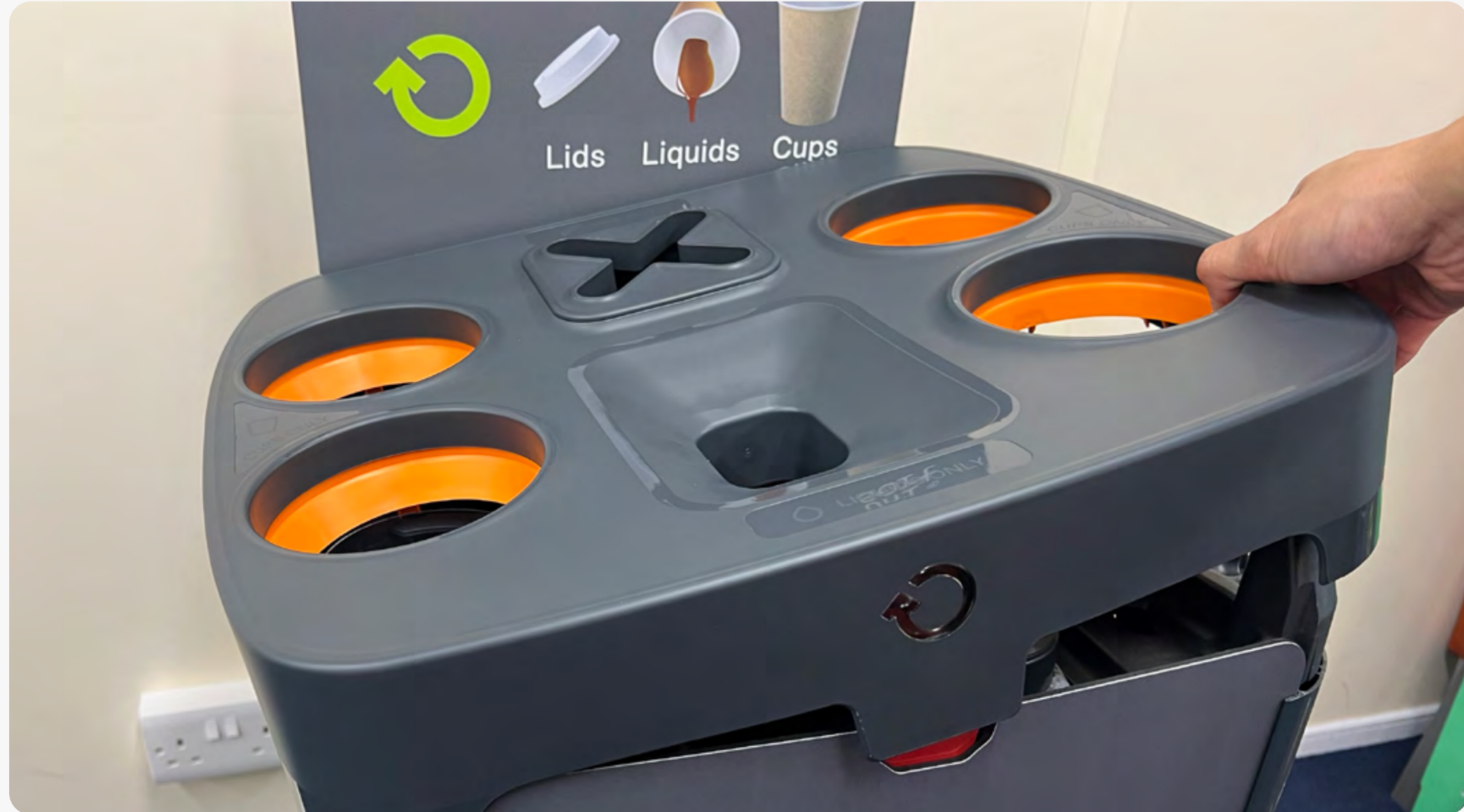
1 Lower cover back into position.

Only applicable if you have a lockable cover