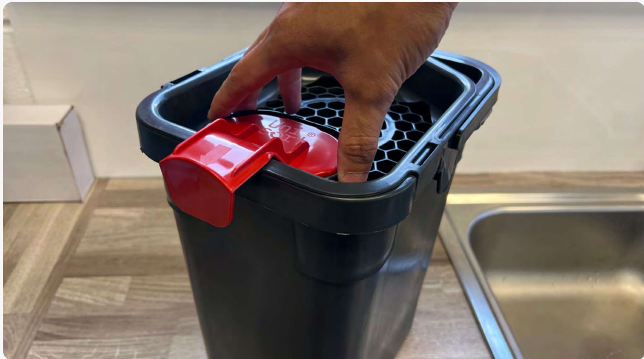
5 Place the float back into position.