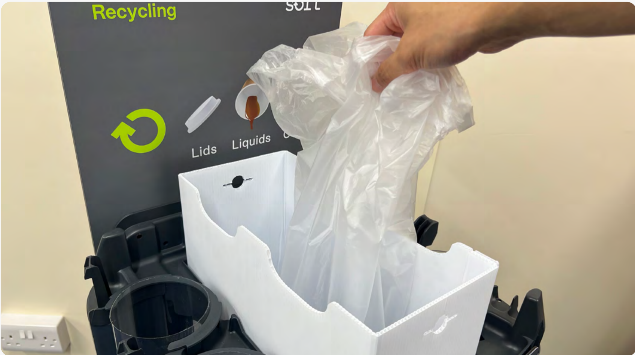
4 Slightly raise the central lid collector to allow excess bag to fold over the top, proceed to the next step.