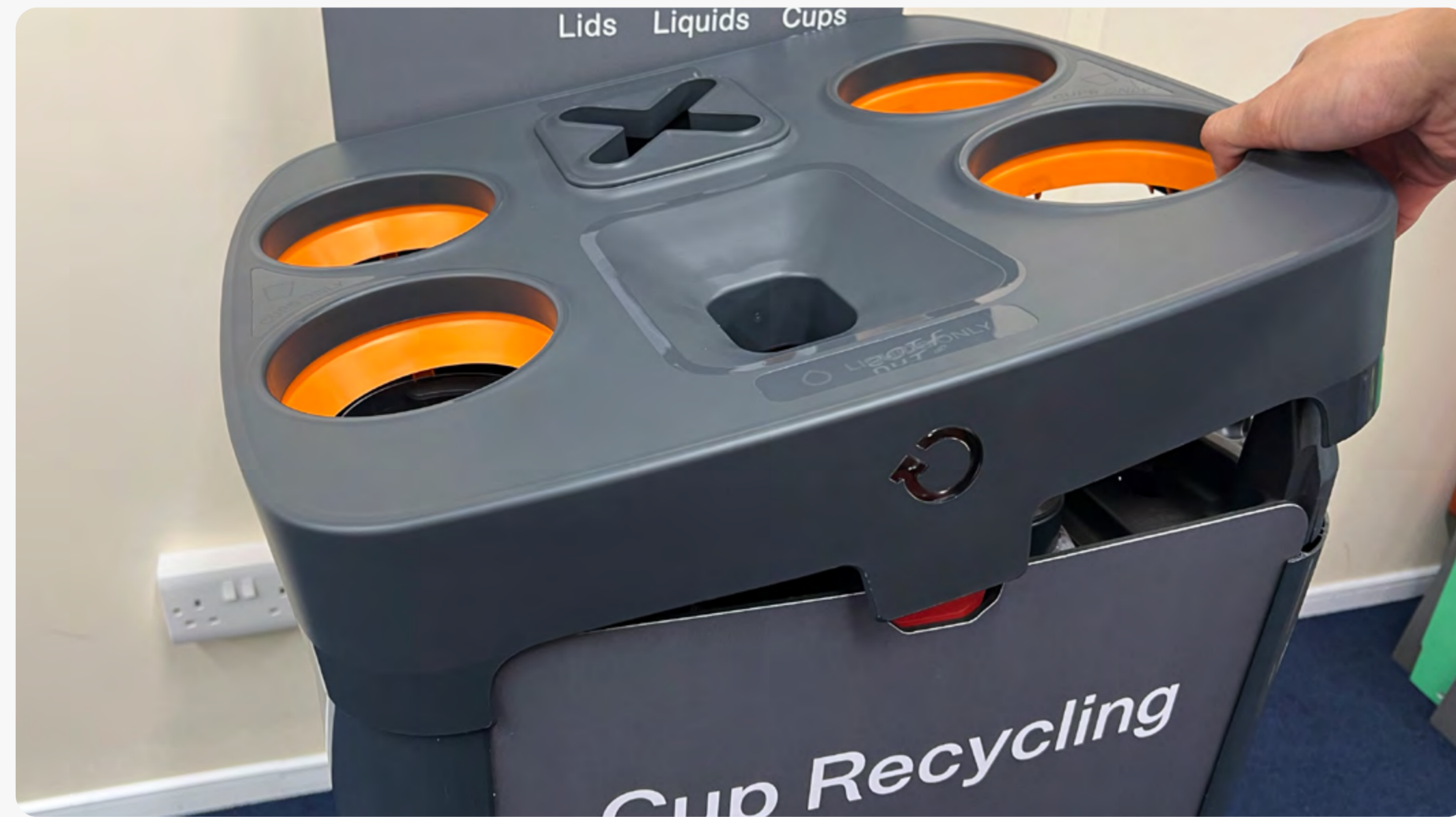
1 Remove the cover from the right hand side of the unit, then place cover on a flat surface.