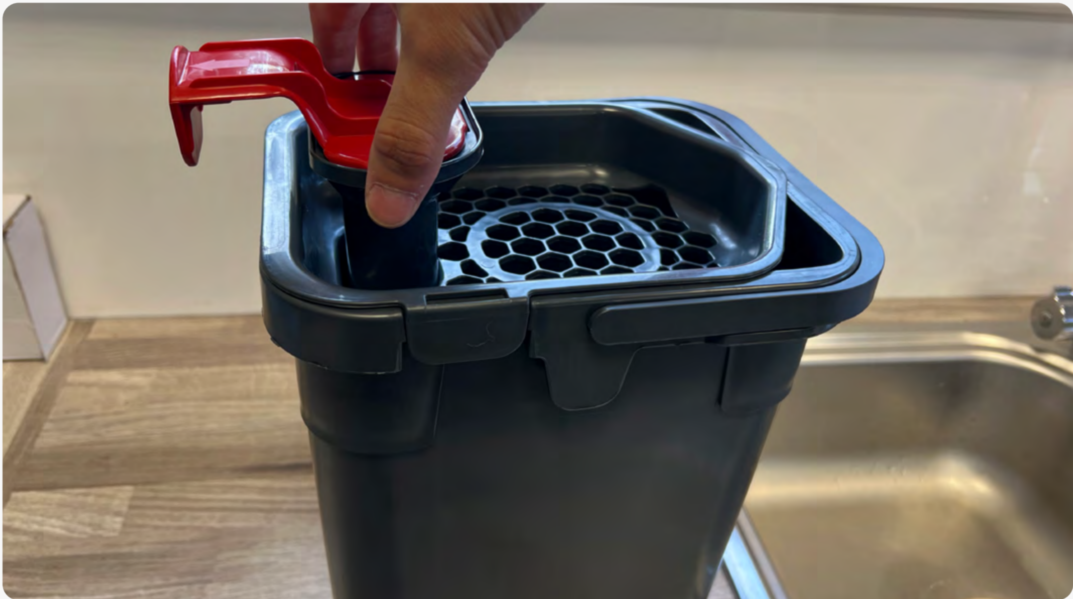
2 Lift the float out of the bucket. (The float is not dishwasher safe)