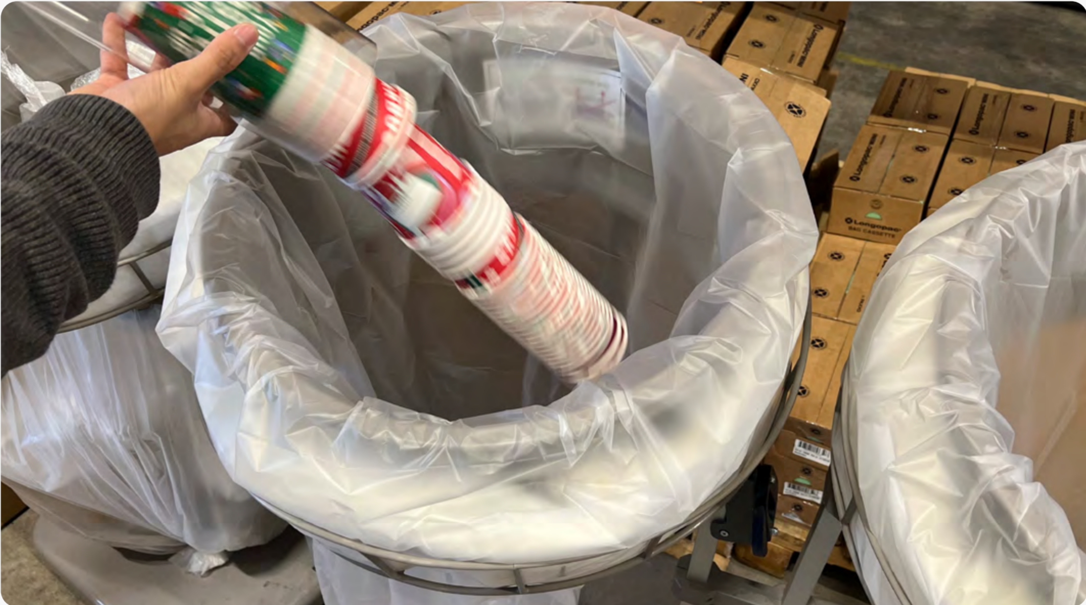
3 Empty cups into the suitable waste stream.