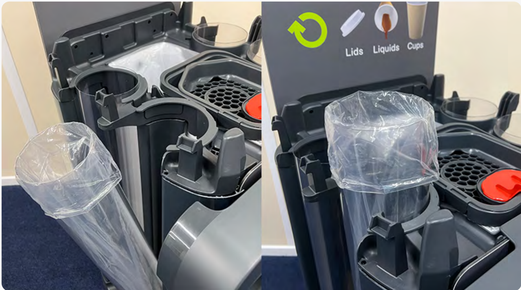
3 Pull tubes to the side or slightly raise the tube, then fold excess bag over the top.