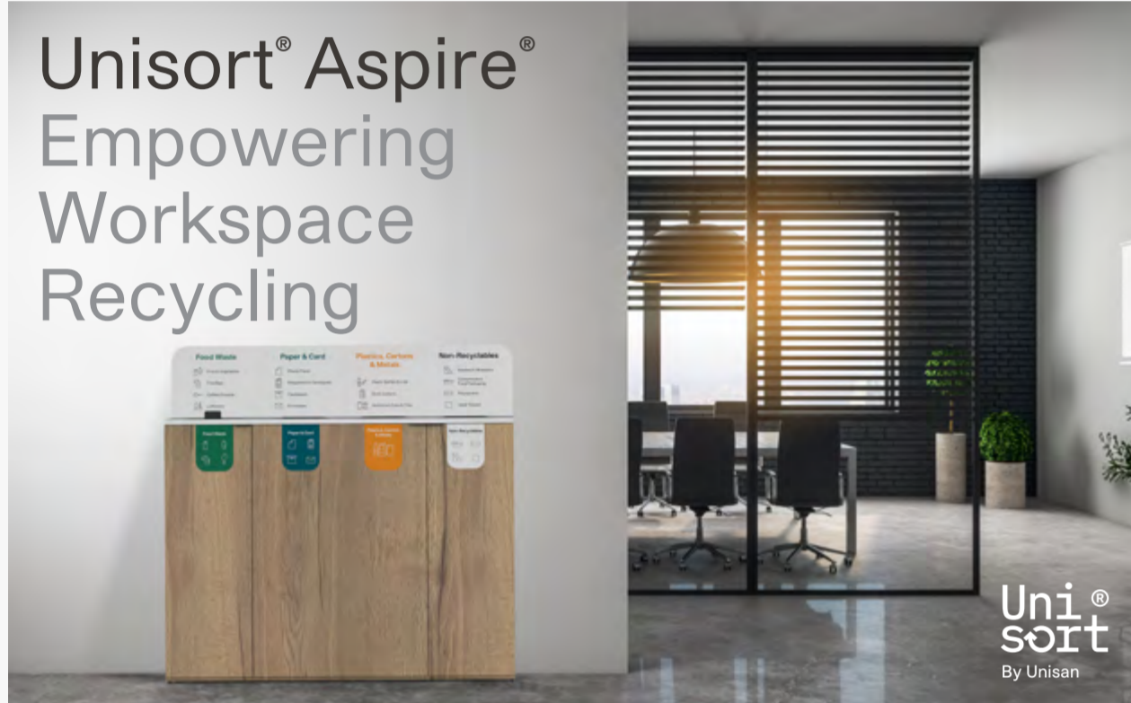
Unisort Aspire Our flagship customisable recycling stations.