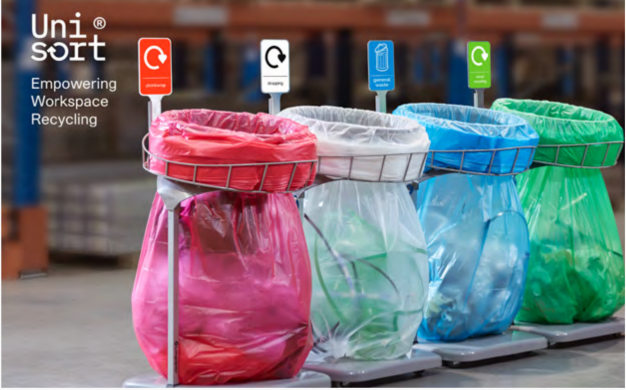
Unisort Liner System The bin liner system that reduces your plastic wastage and