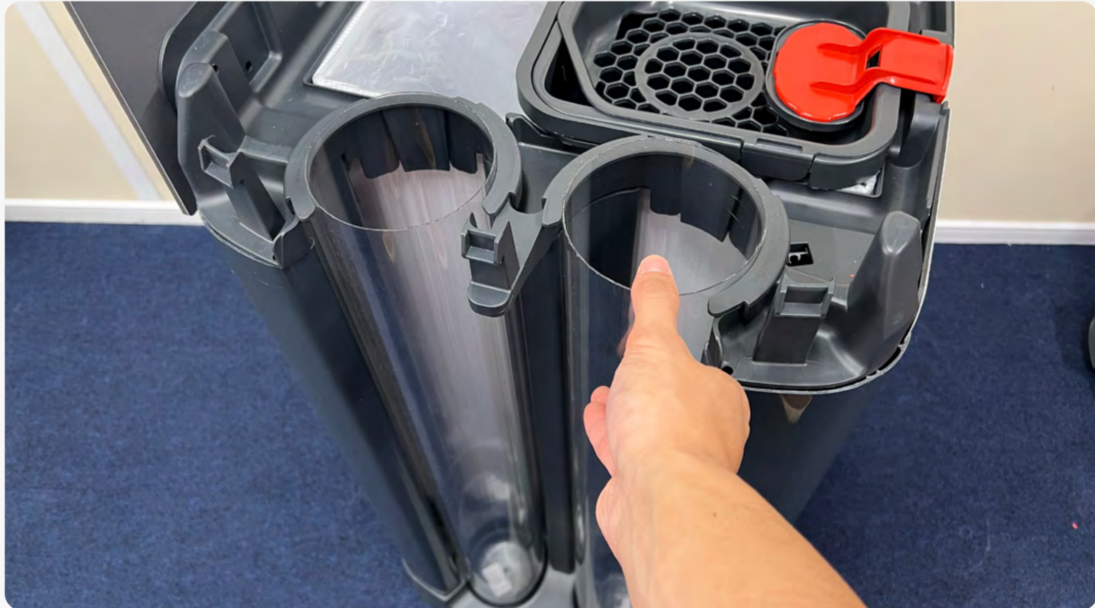
4 Return empty tubes back into the unit, put the cover back on then it's ready to go!