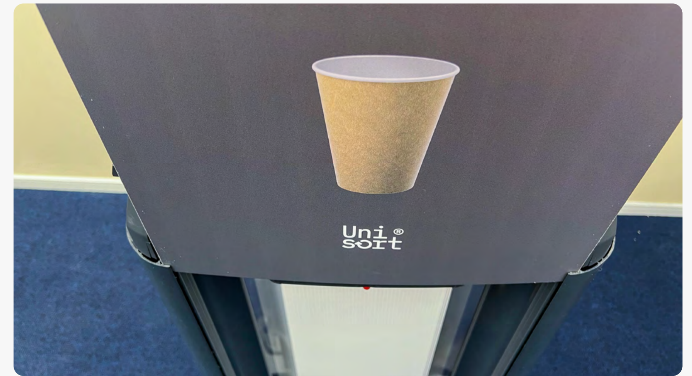
3 Slide the new graphic into the unit making sure the panel goes into the grooves on each side.