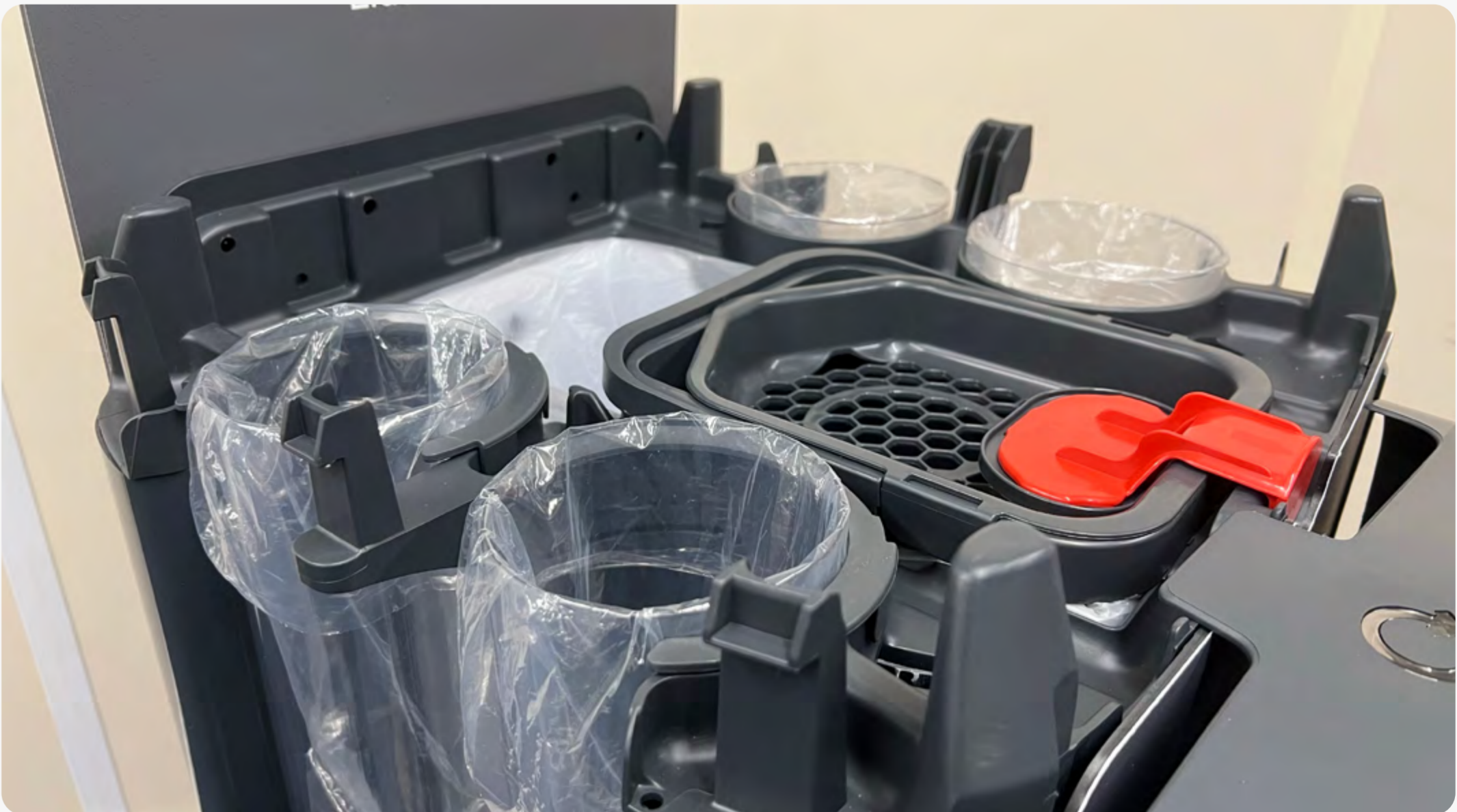
4 Push tubes back into position to secure the bags, repeat for all 4 cup tubes.