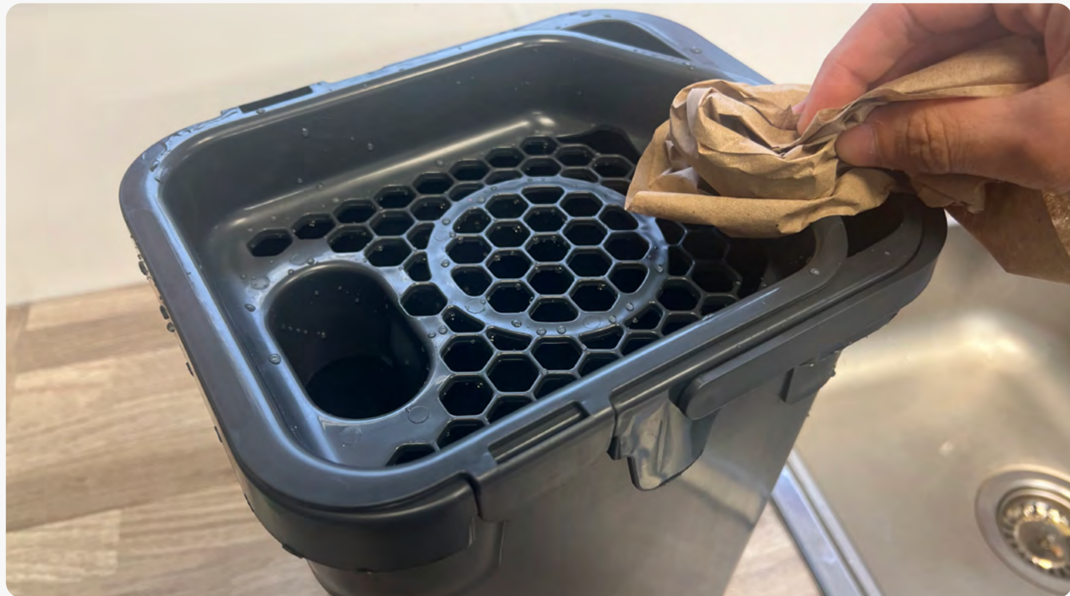
4 Wash the empty liquid bucket until it's clean and wipe it dry.